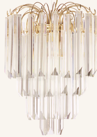
PENDANT 5917.40 DIMENSIONS: H.60CM - Ø.40CM WEIGHT: NET 20KG BULBS: 6X G9 (MAX 28W) MATERIAL: BRASS & GLASS