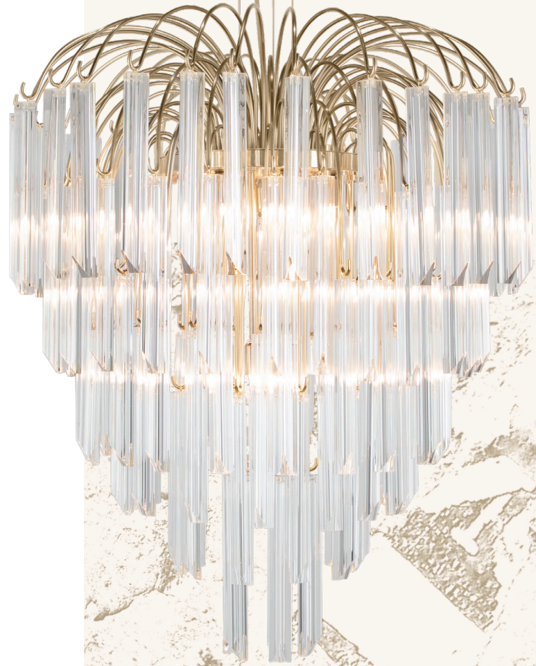
SUSPENSION 5917.60 DIMENSIONS: H.80CM - Ø.60CM WEIGHT: NET 40KG BULBS: 18X G9 (MAX 28W) MATERIAL: BRASS & GLASS