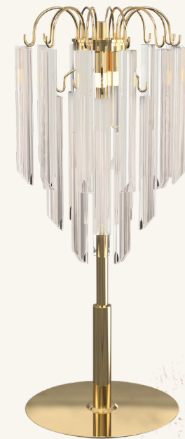
TABLE LAMP 5918.25 DIMENSIONS: H.70CM - Ø.35CM WEIGHT: NET 15KG BULBS: 3X G9 (MAX 28W) MATERIAL: BRASS & GLASS

The Lotus Collection aims to represent simplicity and splendor as its design and form are almost identical to the real flower's shape, incorporating its luxurious feel. The use of noble materials and valuable traditional manufacturing techniques makes this collection unique, as the 24k gold adorned arms with delicate glass increases the visual complexity. The glasses remind us of the calm falling petals from the flower that reflect its simplicity as well as shades of elegance and beauty.