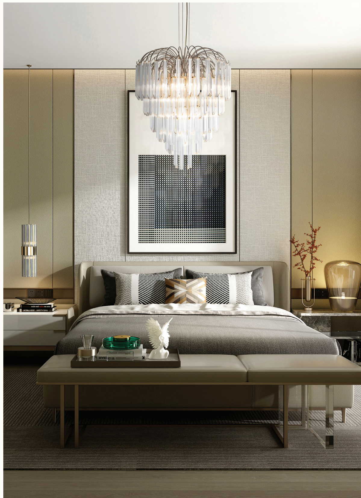
ALSO FEATURED BY CASTRO: HALMA PENDANT

“The Lotus Collection aims to represent simplicity and splendor as its design and form are almost identical to the delicate lotus flower shape, incorporating its luxurious feel.”