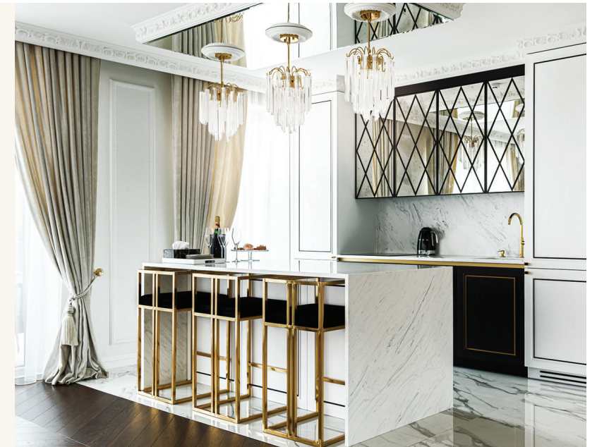
PROJECT BY: CLÉ DE MAISON, LITHUANIA